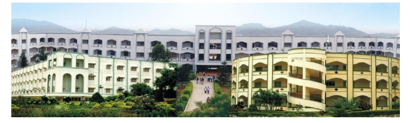
B.TECH. COMPUTER SCIENCE & ENGINEERING (Data Science)

B. Tech. Lateral Entry Scheme from the academic year 2021-22